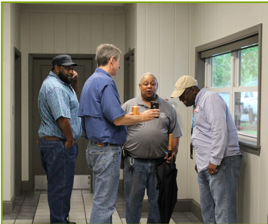
A meeting of the minds prior to the Workshop