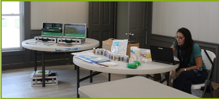
Candace prepares for a big crowd at the larvicide demonstration