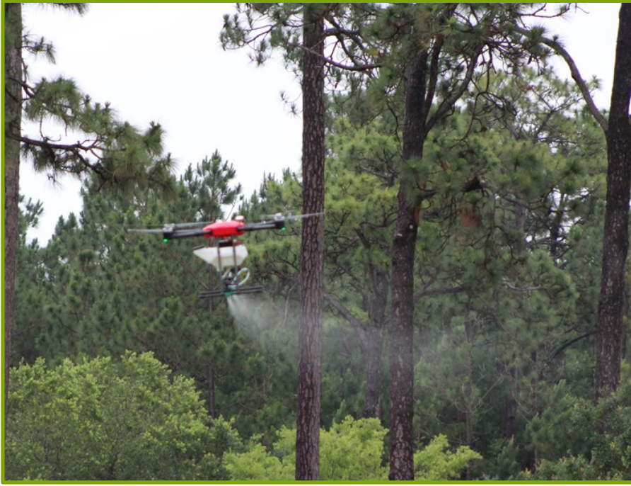
Drone Application Demonstration