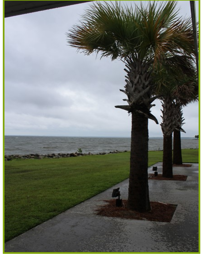
Although the weather wasn't perfect...we had a great turnout!