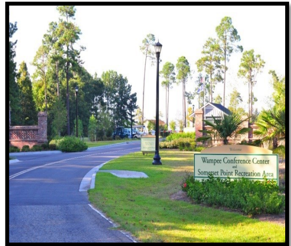
Photos from the beautiful Santee Cooper Wampee Facility on Lake Moultrie