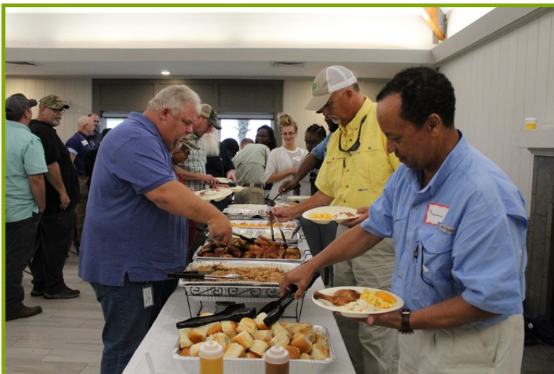
If you feed them, they will come! Music Man BBQ

The rotation through the Larvicide Demonstration was equally appreciated and supported by our Sustaining Members.