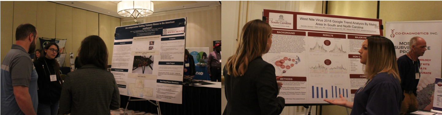
Student Poster Presentations

For additional information and upcoming news, please go to https://www.MAMCA.org and https://www.scmca.net .