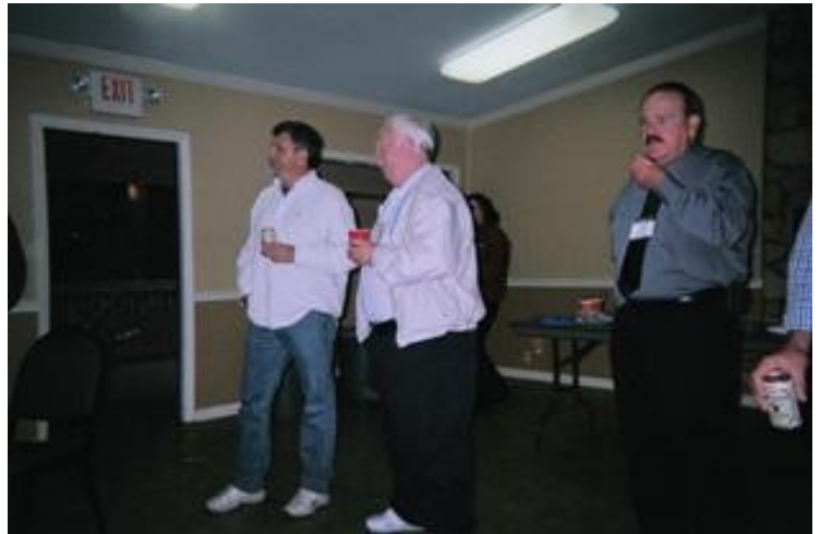
There was some elbow bending.