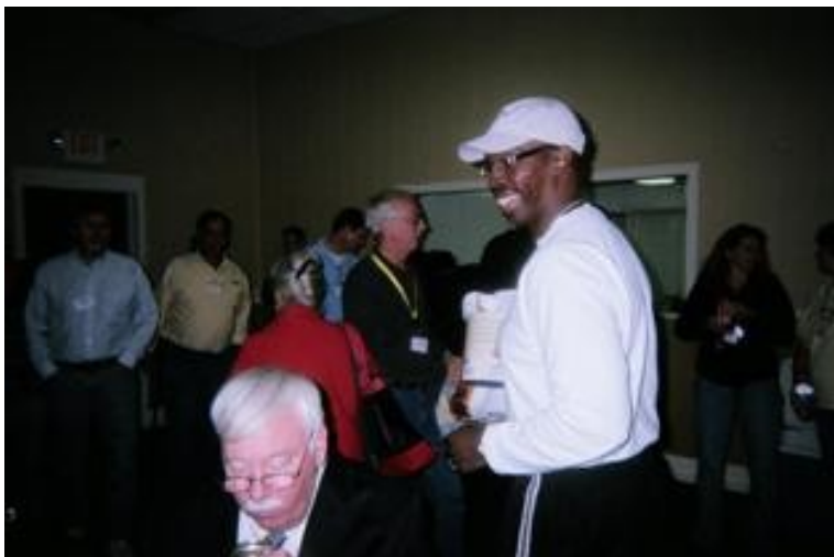
Much to be learned.